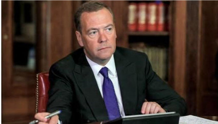
Former Russian President Dmitry Medvedev (archive photo).

If the West continues its 'unrestrained arming of the Kiev regime with the most dangerous weapons', Russia's military campaign will have to move to the next level. At this level, 'predictable boundaries will blur and the potential predictability of the actions of the parties to the conflict will dissolve; the conflict will then develop a momentum of its own, which is inherent in all wars,' Medvedev warned.