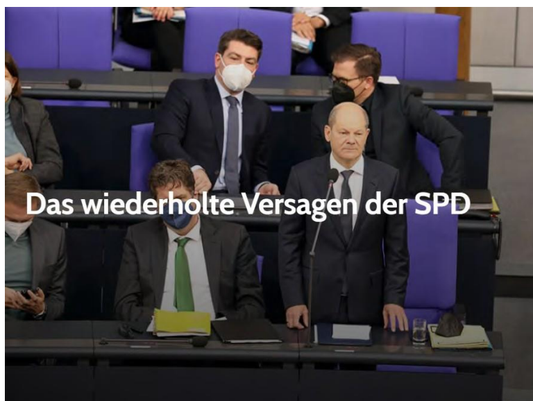
An article by Alexander Neu; 20. September 2022 at 9:00

Source: https://de.sott.net/article/35639-Medwedew-richtet-reale-Tone-an-den-Westen-Um-sie-herum-wird-alles-in-Flammen-stand-and-they-will-grief-harvest-the-country-will-burn