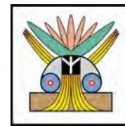
Spirituality Peace Symbol

For CHF/EURO 10.- in an envelope we will send you 3 pieces of coloured peace stickers of the size 120x120 mm. = Stick on the car.