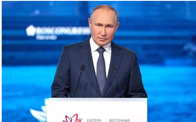
Vladimir Putin (69) on September 7, 2022 at the 7th Eastern Economic Forum in Vladivostok

Vladimir Putin (69) said on 7 September 2022 at the 7th Eastern Economic Forum in Vladivostok: "There is only one way out. Demonstrations are currently taking place in Germany demanding that Nord Stream 2 be unlocked. We share these demands of German consumers, we are ready to do this tomorrow, we just need to press the button, but we have not imposed sanctions on Nord Stream 2."