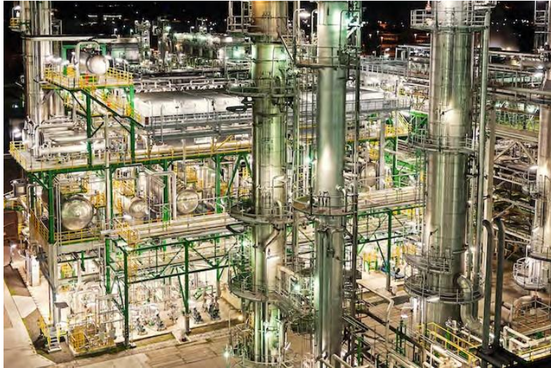
PCK Refinery Schwedt in the Uckermark region of Brandenburg at night

(In the original: "If I give the promise to people in Ukraine: 'We stand with you as long as you need us', then I want to deliver - no matter what my German voters think, but I want to deliver to the people of Ukraine.")