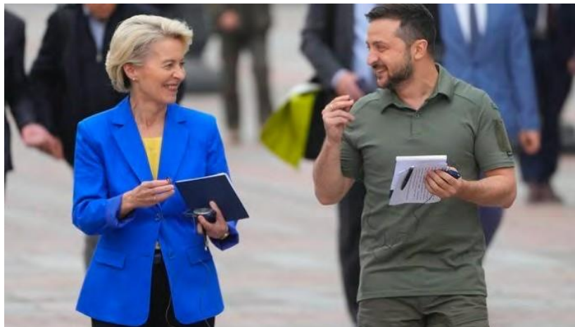
Drunk with victory: EU Commission President Ursula von der Leyen praised Ukrainian President Volodymyr Zelenskyy during her visit to Kiev: "I would like to congratulate you on your military success."