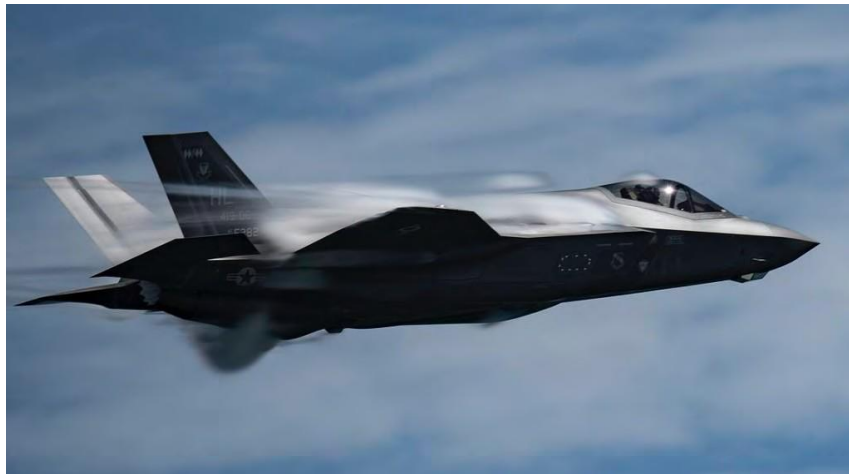
Unsuitable for small neutral Switzerland: the Lockheed Martin F-35

When it became known on 30 June 2021 through the formal decision of the Federal Council that the responsible ministry, the Federal Department of Defence, Civil Protection and Sport DDPS, did not want to buy a European fighter jet but the US F-35, an initiative against this purchase was launched in accordance with the law - "Stop F-35" - and signatures were again collected for it. If, according to the reasoning, it had been known at the time of the vote in autumn 2020 that US fighter jets were to be purchased which could be grounded - put out of service - by the USA at any time at the touch of a button, then the vote at that time would have been different. And consequently, once again - this time the 100,000 signatures needed for an initiative - were gathered for a new vote, the "Stop F-35" initiative, and submitted on August 16, 2022, more than six months before the legally limited deadline of March 1, 2023. The reasoning: The US fighter jet is a fighter jet for wars of aggression, it is not suitable for the defense of a small state, and it makes Switzerland totally dependent on the US: "In the future, the US intelligence service will always sit in the F-35 cockpit."