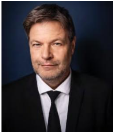
Federal Minister of Economics Dr. Robert Habeck (53, Bündnis 90/Die Grüne)

Federal Economics Minister Dr. Robert Habeck (53, Bündnis 90/Die Grüne) rejected the accusation of stagnation in the search for solutions for the site, but described the situation in Schwedt as 'undisputedly difficult'.