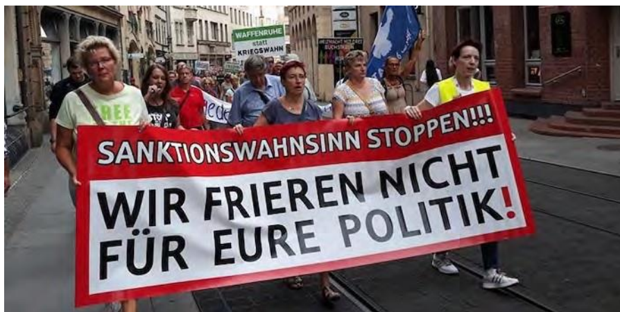
Want to stop sanctions against Russia. Demonstrators on 22 August 2022 at the Monday demonstration in Halle

In Halle , the same banner has been held aloft in the front row every Monday since August 1, 2022: 'Stop Sanctions Madness!!! WE WON'T FREEZE FOR YOUR POLITICS!'