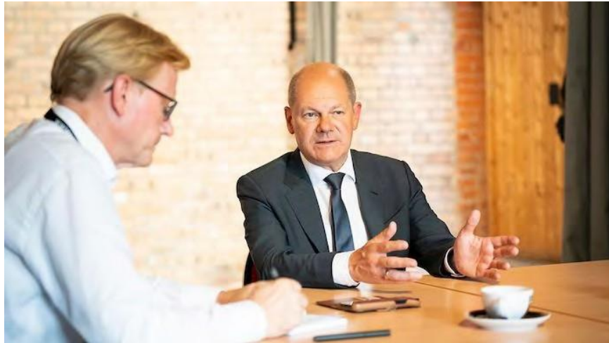
Federal Chancellor Olaf Scholz (64, SPD, on the right in the photo) in an interview with Magdeburger Volksstimme

On 30 August 2022, Chancellor Scholz told the Magdeburger Volksstimme: "The Western sanctions are effective and correct. They are an important means of increasing the pressure on Russia to finally end this war. Because the costs for Moscow are considerable. The country is cut off from the world's technological progress. The longer this continues, the greater the damage to Russia will be. For me, Germany's withdrawal is out of the question. Europe's strong and united response to this war has surprised Putin. He didn't expect it."